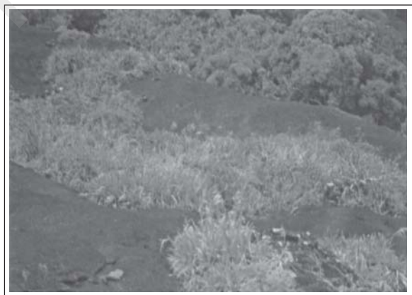
Figure 16.3 : Zenkeria Sebastinei — a critically endangered grass in Agasthiyamalai peak (India)