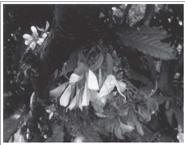
Figure 16.4 : Humboldtia decurrens Bedd — highly rare endemic tree of Southern Western Ghats (India)

Population of these species is very small in the world; they are confined to limited areas or thinly scattered over a wider area.