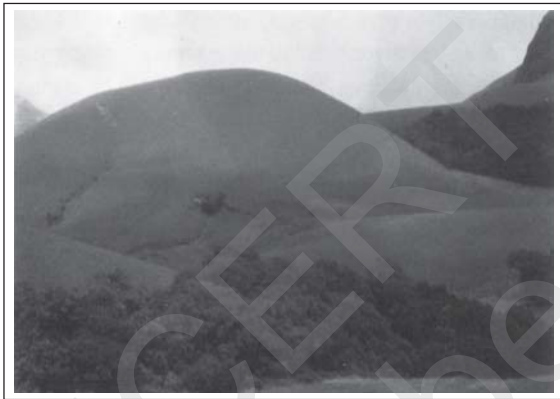
Figure 16.1 : Grasslands and sholas in Indira Gandhi National Park, Annamalai, Western Ghats — an example of ecosystem diversity

You have studied about the ecosystem in the earlier chapter. The broad differences between ecosystem types and the diversity of habitats and ecological processes occurring within each ecosystem type constitute the ecosystem diversity. The 'boundaries' of communities (associations of species) and ecosystems are not very rigidly defined. Thus, the demarcation of ecosystem boundaries is difficult and complex.