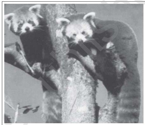
Figure 16.2 : Red Panda — an endangered species

It includes those species which are in danger of extinction. The IUCN publishes information about endangered species world-wide as the Red List of threatened species.