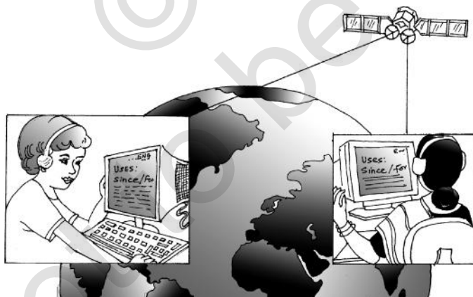
Fig. 3.1 Outsourcing: a new employment opportunity in big cities

The WTO was founded in 1995 as the successor organisation to the General Agreement on Trade and Tariff (GATT). GATT was established in 1948 with 23 countries as the global trade organisation to administer all multilateral trade agreements by providing equal opportunities to all countries in the international market for trading purposes. WTO is expected to establish a rule-based trading regime in which nations cannot place arbitrary restrictions on trade. In addition, its purpose is also to enlarge