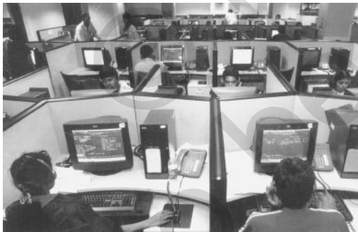
Fig. 3.2 IT Industry is seen as a major contributor to India's exports

Some scholars question the usefulness of India being a member of the WTO as a major volume of international trade occurs among the developed nations. They also say that while developed countries file complaints over agricultural subsidies given in their countries, developing countries feel cheated as they are forced to open up their markets for developed countries but are not allowed access to the markets of developed countries. What do you think?