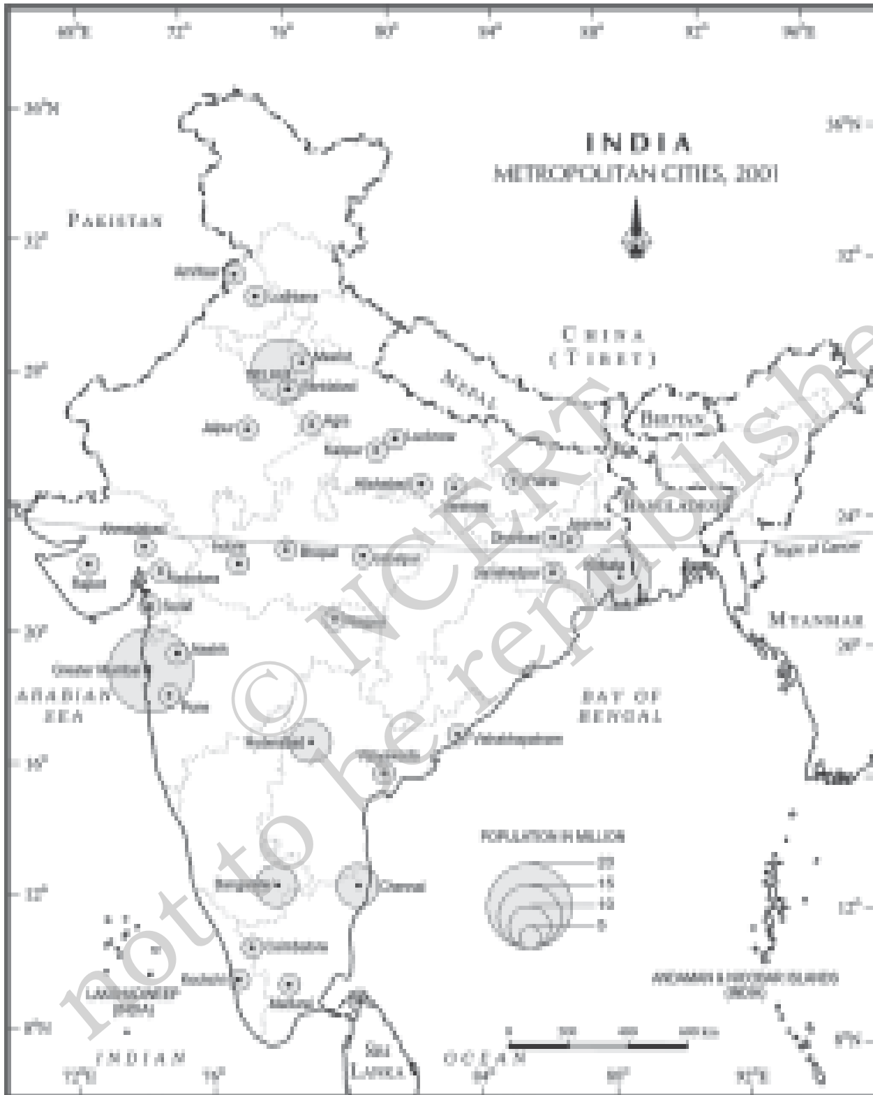
Fig. 4.5 : India - Metropolitan Cities, 2001