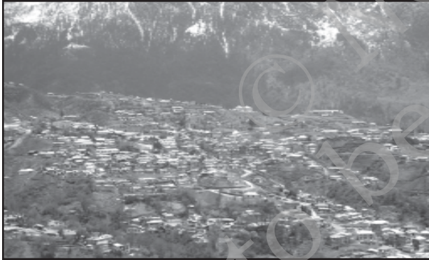
Fig. 4.1 : Clustered Settlements in the North-eastern states

The clustered rural settlement is a compact or closely built up area of houses. In this type of village the general living area is distinct and separated from the surrounding farms, barns and pastures. The closely built-up area and its