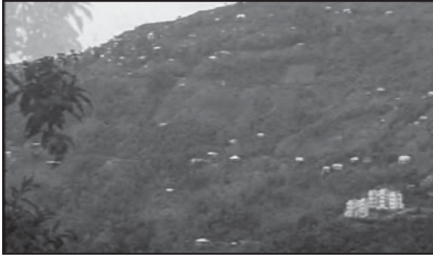
Fig. 4.3 : Dispersed settlements in Nagaland

with farms or pasture on the slopes. Extreme dispersion of settlement is often caused by extremely fragmented nature of the terrain and land resource base of habitable areas. Many areas of Meghalaya, Uttaranchal, Himachal Pradesh and Kerala have this type of settlement.