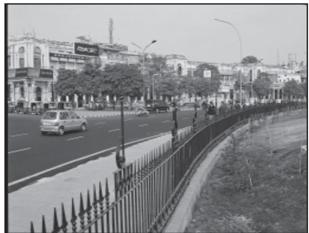
Fig. 4.4 : A view of the modern city

The British and other Europeans have developed a number of towns in India. Starting their foothold on coastal locations, they first developed some trading ports such as Surat, Daman, Goa, Pondicherry, etc. The British later consolidated their hold around three principal nodes – Mumbai (Bombay), Chennai (Madras), and Kolkata (Calcutta) – and built them in the British style. Rapidly