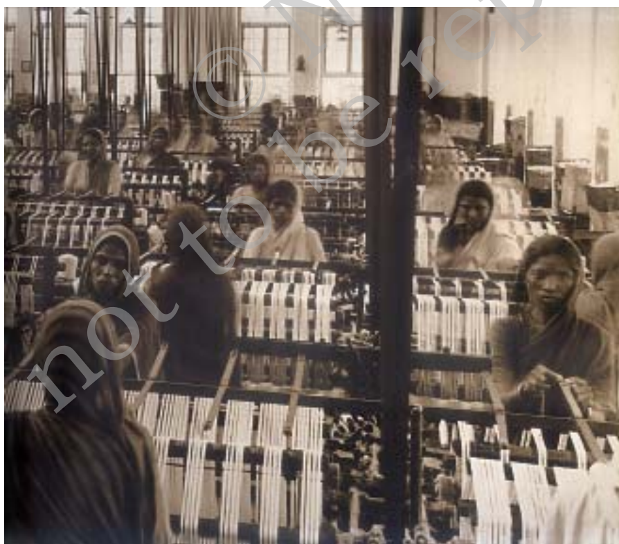
Fig. 10 – Workers in a cotton factory, circa 1900

The first cotton mill in India was set up as a spinning mill in Bombay in 1854. From the early nineteenth century, Bombay had grown as an important port for the export of raw cotton from India to England and China. It was close to the vast black soil tract of western India where cotton was grown. When the cotton textile mills came up they could get supplies of raw material with ease.