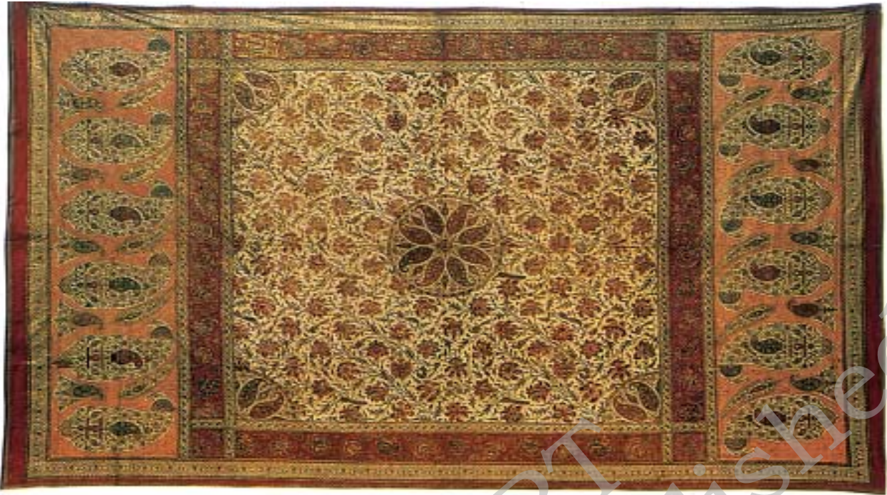
Fig. 5 – Printed design on fine cloth (chintz) produced in Masulipatnam, Andhra Pradesh, mid-nineteenth century

This is a fine example of the type of chintz produced for export to Iran and Europe.