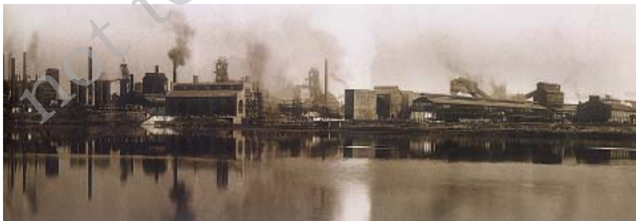
Fig. 14 – The Tata Iron and Steel factory on the banks of the river Subarnarekha, 1940

Slag heaps – The waste left when smelting metal