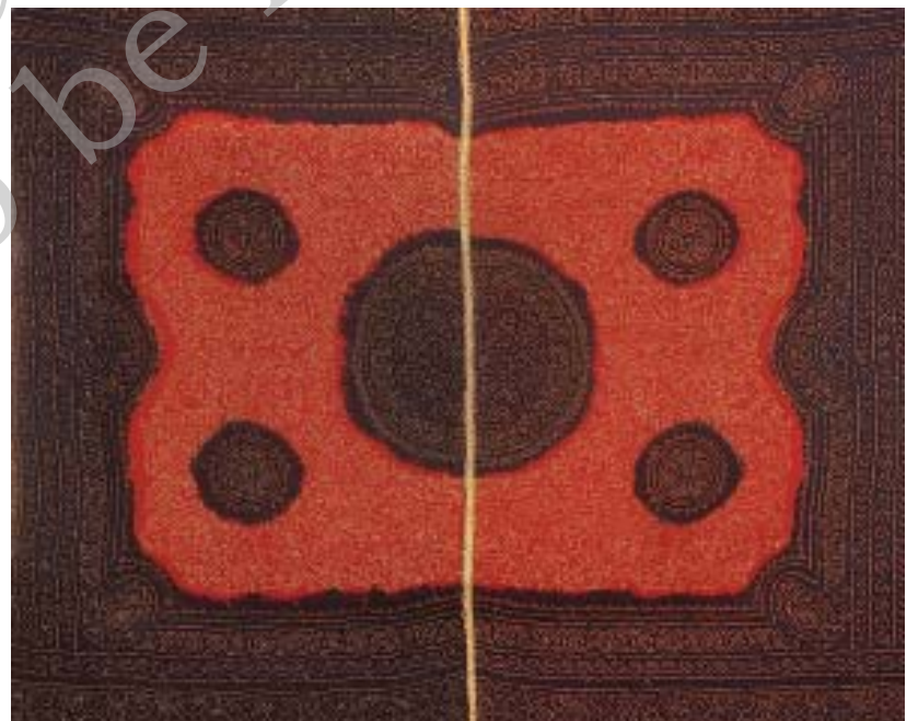
Fig. 6 – Bandanna design, early twentieth century

There were other cloths in the order book that were noted by their place of origin: Kasimbazar, Patna, Calcutta, Orissa, Charpoore. The widespread use of such words shows how popular Indian textiles had become in different parts of the world.