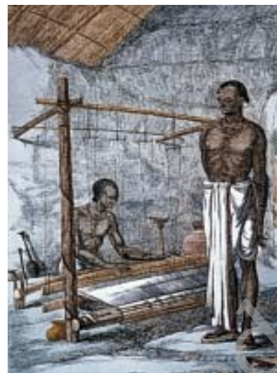
Fig. 9 – A tanti weaver of Bengal, painted by the Belgian painter Solvyns in the 1790s

By the beginning of the nineteenth century, English-made cotton textiles successfully ousted Indian goods from their traditional markets in Africa, America and Europe. Thousands of weavers in India were now thrown out of employment. Bengal weavers were the worst hit. English and European companies stopped buying Indian goods and their agents no longer gave out