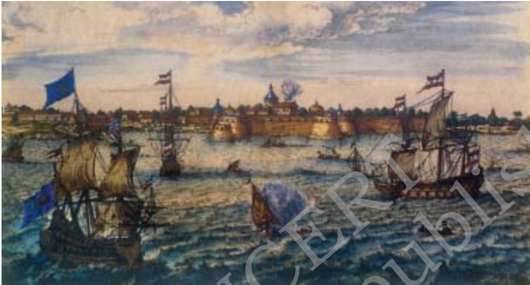
Fig. 1 – Trading ships on the port of Surat in the seventeenth century

Surat in Gujarat on the west coast of India was one of the most important ports of the Indian Ocean trade. Dutch and English trading ships began using the port from the early seventeenth century. Its importance declined in the eighteenth century.