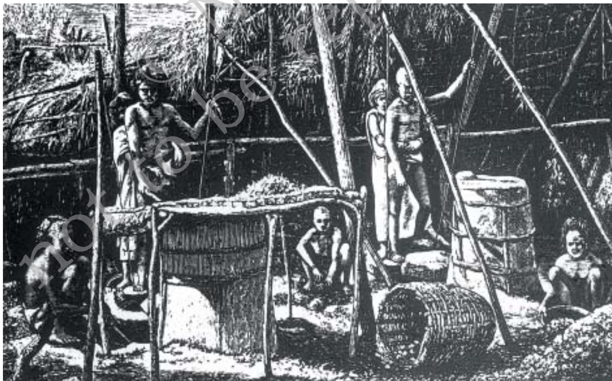
Fig. 12 – Iron smelters of Palamau, Bihar

Bellows – A device or equipment that can pump air