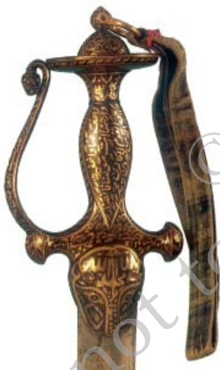
Fig. 11 – Tipu's sword made in the late eighteenth century

Francis Buchanan who toured through Mysore in 1800, a year after Tipu Sultan's death, has left us an account of the technique by which Wootz steel was produced in many hundreds of smelting furnaces in Mysore. In these furnaces, iron was mixed with charcoal and put inside small clay pots. Through an intricate control of temperatures the smelters produced steel ingots that were used for sword making not just in India but in West and Central Asia too. Wootz is an anglicised