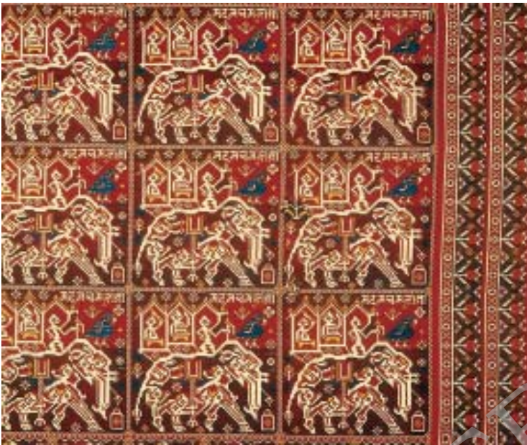
Fig. 2 – Patola weave, mid-nineteenth century Patola was woven in Surat, Ahmedabad and Patan. Highly valued in Indonesia, it became part of the local weaving tradition there.

Let us first look at textile production.