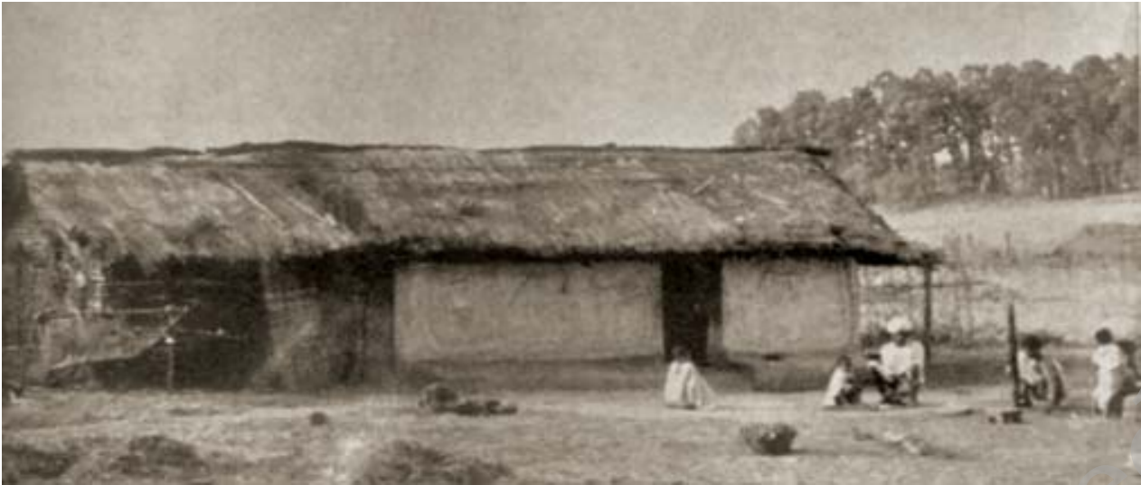
Fig. 13 – A village in Central India where the Agarias – a community of iron smelters – lived.

Some communities like the Agarias specialised in the craft of iron smelting. In the late nineteenth century a series of famines devastated the dry tracts of India. In Central India, many of the Agaria iron smelters stopped work, deserted their villages and migrated, looking for some other work to survive the hard times. A large number of them never worked their furnaces again.