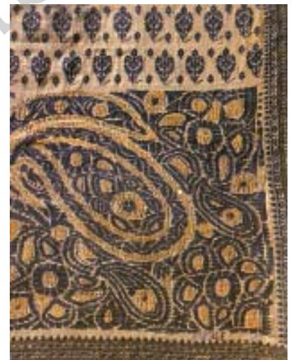
Fig. 4 – Jamdani weave, early twentieth century

Notice how each item in the order book was carefully priced in London. These orders had to be placed two years in advance because this was the time required to send orders to India, get the specific cloths woven and shipped to Britain. Once the cloth pieces arrived in London they were put up for auction and sold.