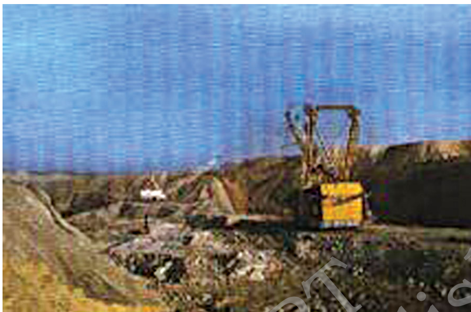
Fig. 5.2: A coal mine

When heated in air, coal burns and produces mainly carbon dioxide gas.