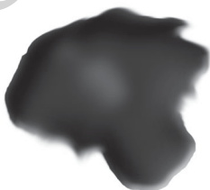
Fig. 5.3: Coal-tar

It is a black, thick liquid (Fig. 5.3) with unpleasant smell. It is a mixture of