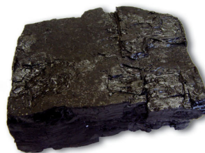
Fig. 5.1: Coal

You may have seen coal, or heard about it (Fig. 5.1). It is as hard as stone and is black in colour.