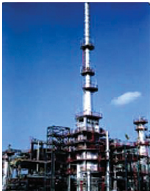
Fig. 5.5: A petroleum refinery

fractions of petroleum is known as refining. It is carried out in a petroleum refinery (Fig. 5.5).