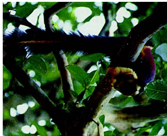
Fig. 7.3 (b) : Giant squirrel

endemic flora of the Pachmarhi Biosphere Reserve. Bison, Indian giant squirrel [Fig. 7.3 (b)] and flying squirrel are endemic fauna of this area. Professor Ahmad explains that the destruction of their habitat, increasing population and introduction of new species may affect the natural habitat of endemic species and endanger their existence.