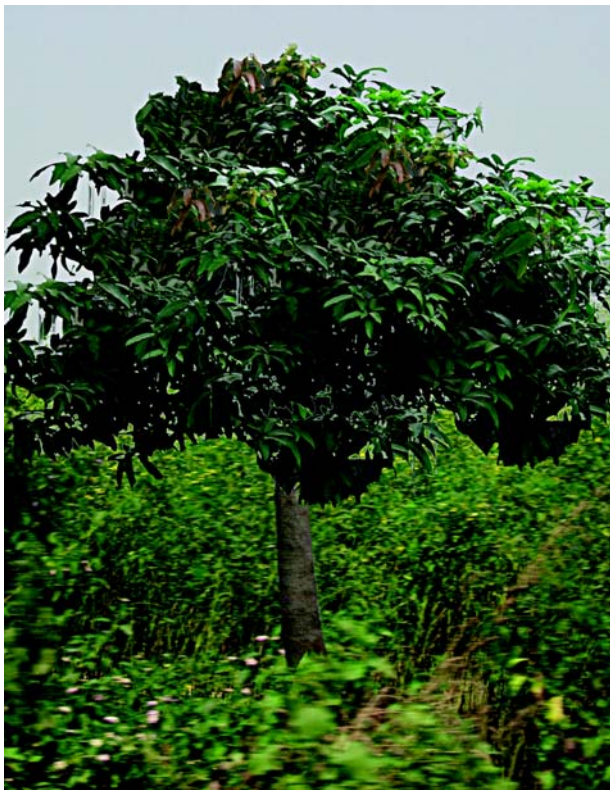
Fig. 7.3 (a) : Wild Mango

Madhavji shows sal and wild mango (Fig. 7.3 (a)) as two examples of the