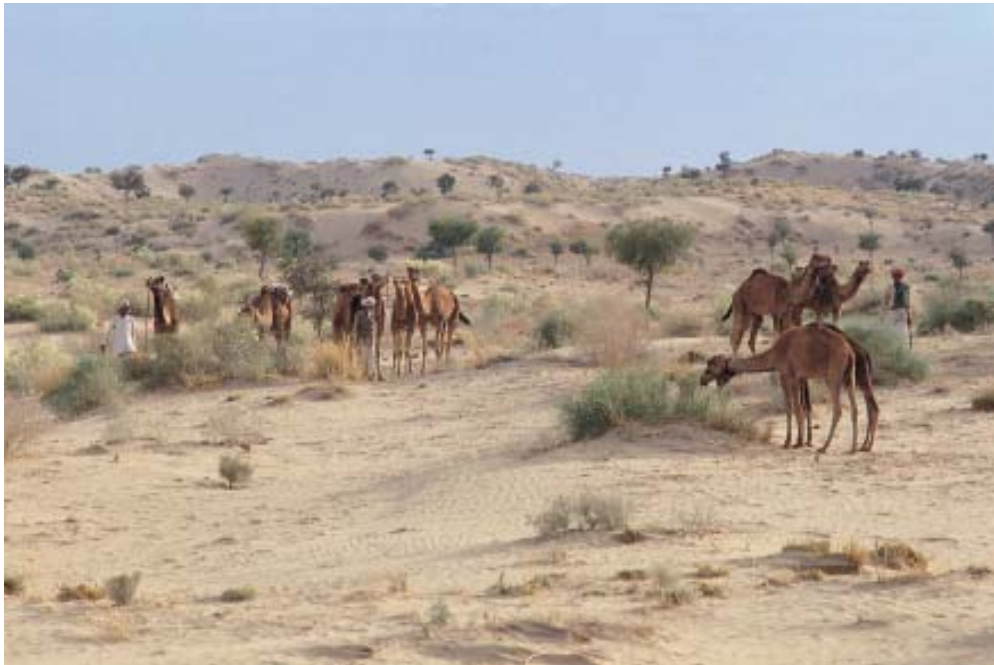
Fig.5 – Raika camels grazing on the Thar desert in western Rajasthan.

Dhangars were an important pastoral community of Maharashtra. In the early twentieth century their population in this region was estimated to be 467,000. Most of them were shepherds, some were blanket weavers, and still others were buffalo herders. The Dhangar shepherds stayed in the central plateau of Maharashtra during the monsoon. This was a semi-arid region with low rainfall and poor soil. It was covered with thorny scrub. Nothing but dry crops like bajra could be sown here. In the monsoon this tract became a vast grazing ground for the Dhangar flocks. By October the Dhangars harvested their bajra and started on their move west. After a march of about a month they reached the Konkan. This was a flourishing agricultural tract with high rainfall and rich soil. Here the shepherds