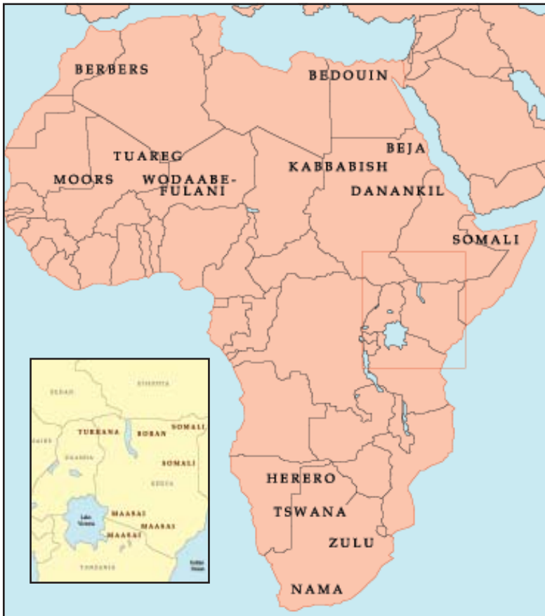
Fig. 13 – Pastoral communities in Africa. The inset shows the location of the Maasais in Kenya and Tanzania.

We will discuss some of these changes by looking at one pastoral community – the Maasai – in some detail. The Maasai cattle herders live primarily in east Africa: 300,000 in southern Kenya and another 150,000 in Tanzania. We will see how new laws and regulations took away their land and restricted their movement. This affected their lives in times of drought and even reshaped their social relationships.