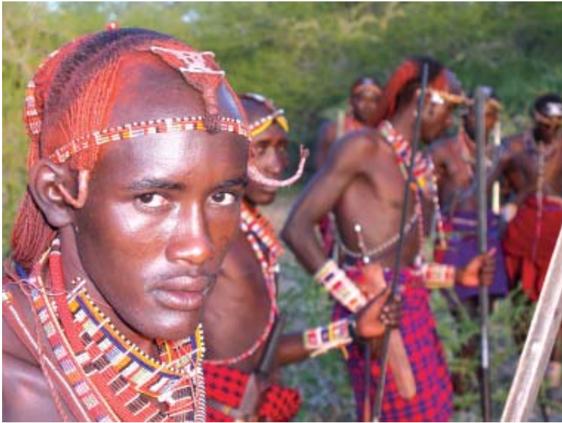
Fig. 17 - Even today, young men go through an elaborate ritual before they become warriors, although actually it is no longer common. They must travel throughout the section's region for about four months, ending with an event where they run to the homestead and enter with an attitude of a raider. During the ceremony, boys dress in loose clothing and dance non-stop throughout the day. This ceremony is the transition into a new age. Girls are not required to go through such a ritual.

To administer the affairs of the Maasai, the British introduced a series of measures that had important implications. They appointed chiefs of different sub-groups of Maasai, who were made responsible for the affairs of the tribe. The British imposed various restrictions on raiding and warfare. Consequently, the traditional authority of both elders and warriors was adversely affected.