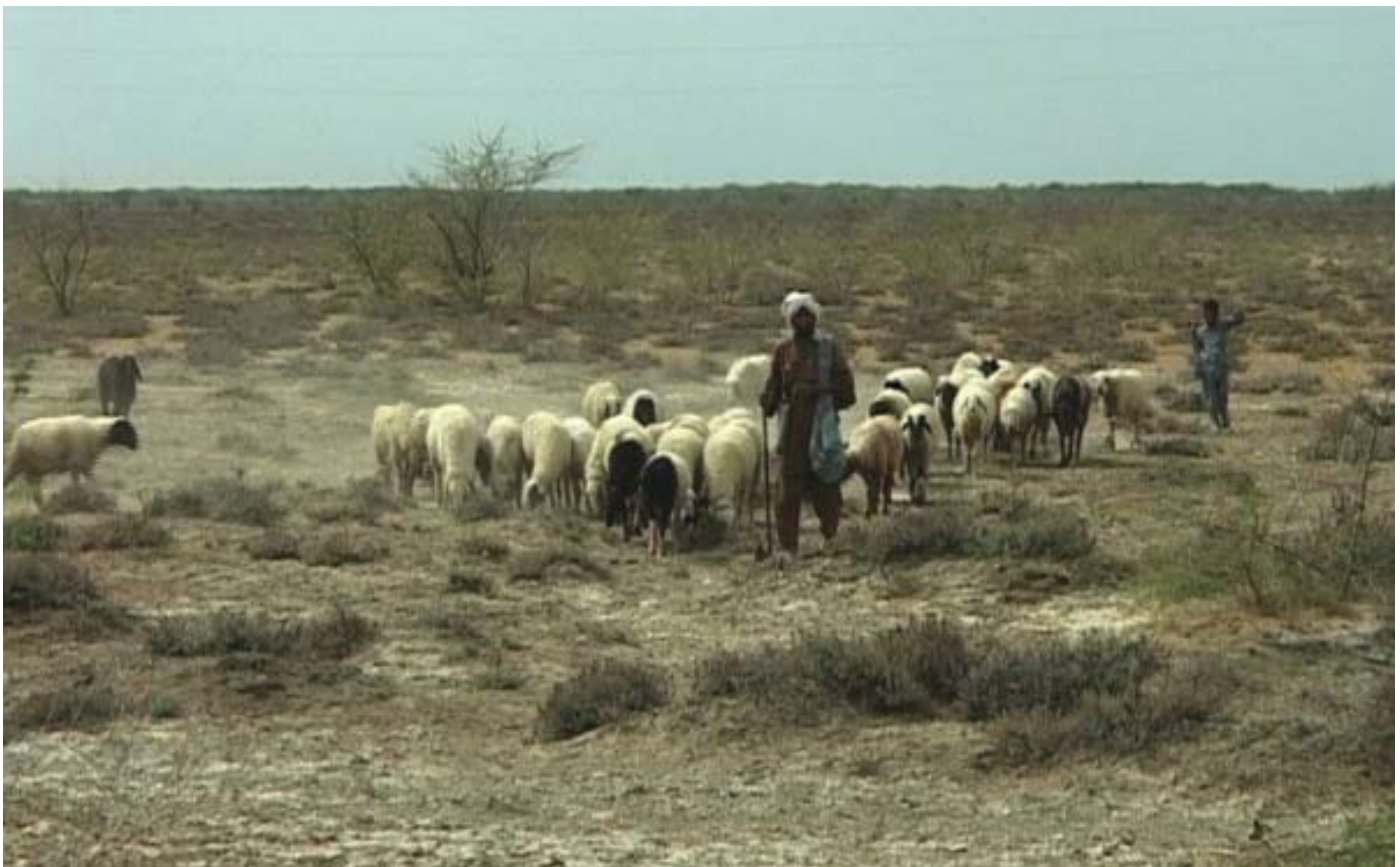
Fig. 10 – Maldhari herders moving in search of pastures. Their villages are in the Rann of Kutch.