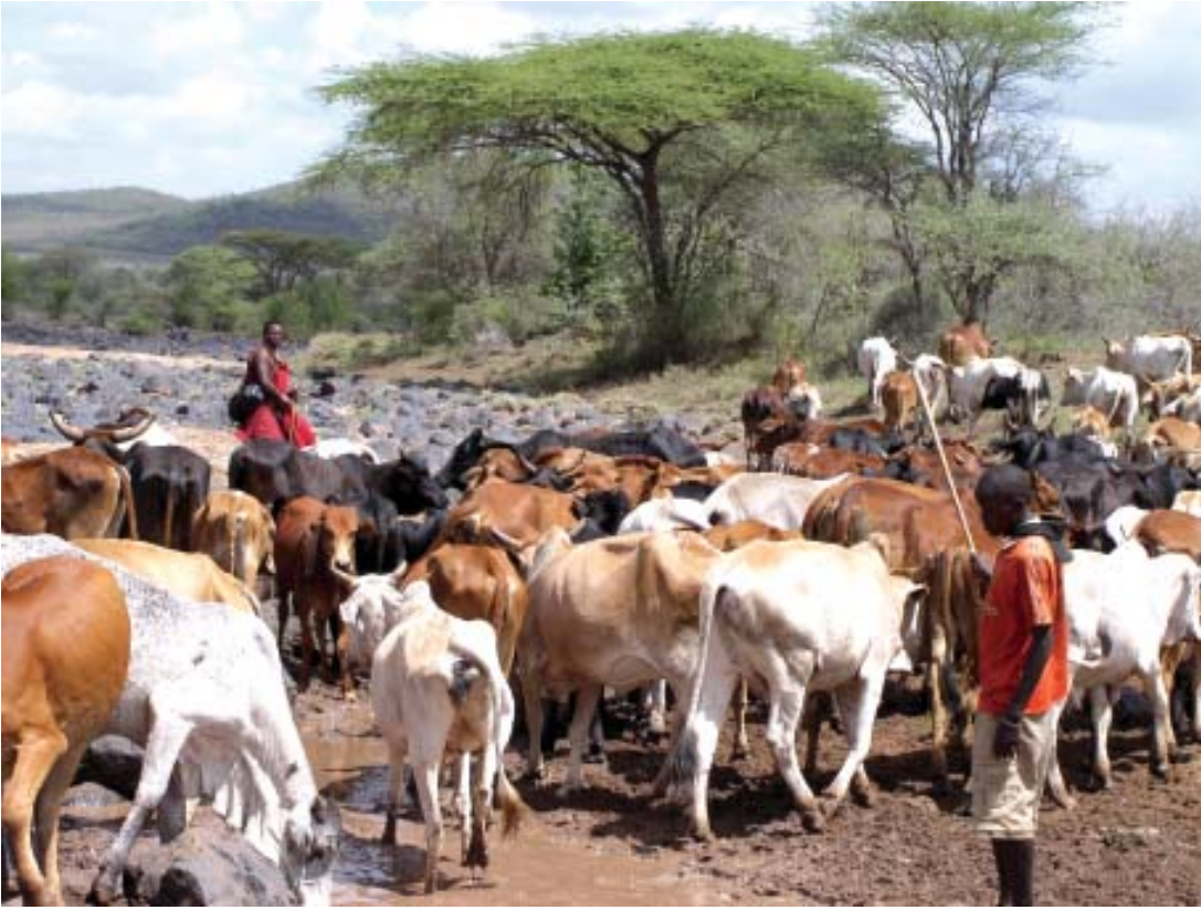
Fig. 15 – The title Maasai derives from the word Maa . Maa-sai means 'My People'. The Maasai are traditionally nomadic and pastoral people who depend on milk and meat for subsistence. High temperatures combine with low rainfall to create conditions which are dry, dusty, and extremely hot. Drought conditions are common in this semi-arid land of equatorial heat. During such times pastoral animals die in large numbers.