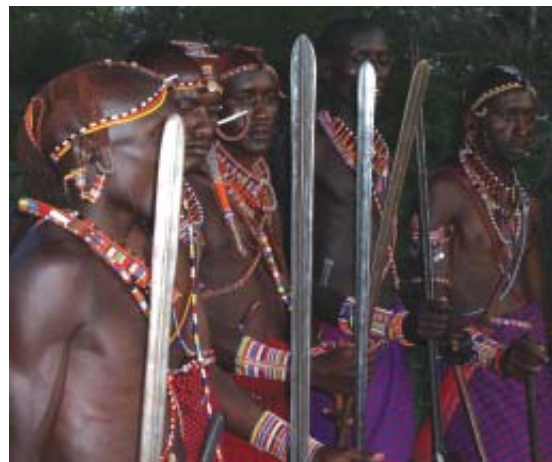
Fig. 16 – Note how the warriors wear traditional deep red shukas, brightly beaded Maasai jewelry and carry five-foot, steel tipped spears. Their long pleats of intricately plaited hair are tinted red with ochre. As per tradition they face East to honour the rising sun. Warriors are in charge of society's security while boys are responsible for herding livestock. During the drought season, both warriors and boys assume responsibility for herding livestock.

In Maasailand, as elsewhere in Africa, not all pastoralists were equally affected by the changes in the colonial period. In pre-colonial times Maasai society was divided into two social categories – elders and warriors. The elders formed the ruling group and met in periodic councils to decide on the affairs of the community and settle disputes. The warriors consisted of younger people, mainly responsible for the protection of the tribe. They defended the community and organised cattle raids. Raiding was important in a society where cattle was wealth. It is through raids that the power of different pastoral groups was asserted. Young men came to be recognised as members of the warrior class when they proved their manliness by raiding the cattle of other pastoral groups and participating in wars. They, however, were subject to the authority of the elders.