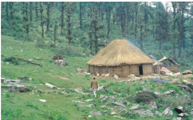
Fig.2 – A Gujjar Mandap on the high mountains in central Garhwal. The Gujjar cattle herders live in these mandaps made of ringal – a hill bamboo – and grass from the Bugyal. A mandap was also a work place. Here the Gujjar used to make ghee which they took down for sale. In recent years they have begun to transport the milk directly in buses and trucks. These mandaps are at about 10,000 to 11,000 feet. Buffaloes cannot climb any higher.