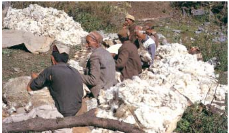
Fig.4 – Gaddi sheep being sheared.

Bugyal – Vast meadows in the high mountains