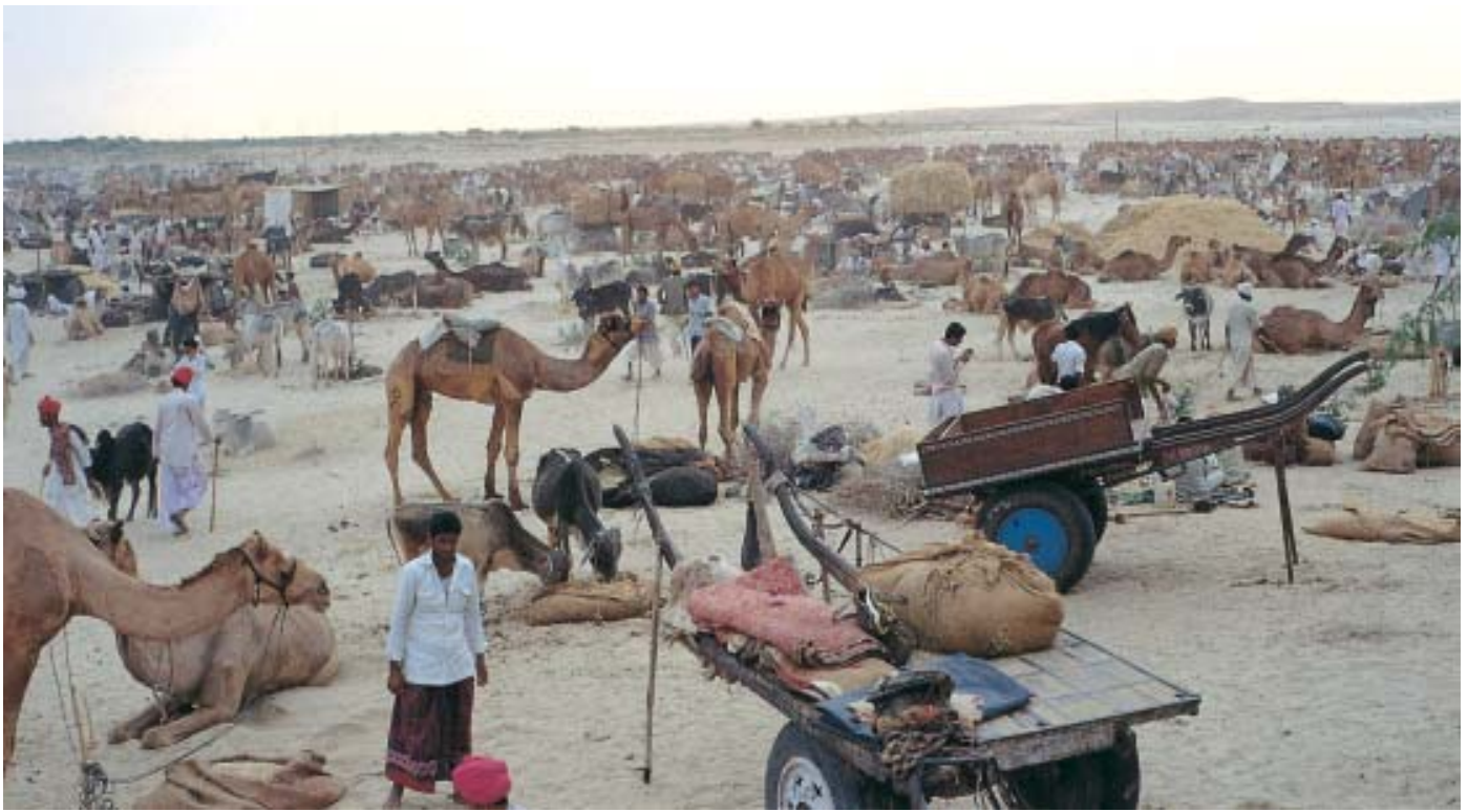
Fig.7 – A camel fair at Balotra in western Rajasthan. Camel herders come to the fair to sell and buy camels. The Maru Raikas also display their expertise in training their camels. Horses from Gujarat are also brought for sale at this fair.

So we see that the life of these pastoral groups was sustained by a careful consideration of a host of factors. They had to judge how long the herds could stay in one area, and know where they could find water and pasture. They needed to calculate the timing of their movements, and ensure that they could move through different territories. They had to set up a relationship with farmers on the way, so that the herds could graze in harvested fields and manure the soil. They combined a range of different activities – cultivation, trade, and herding – to make their living.