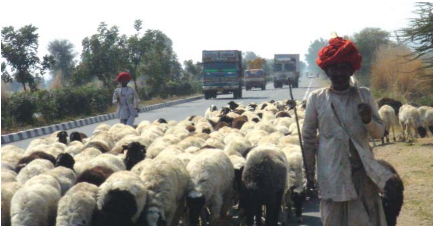
Fig. 18 – A Raika shepherd on Jaipur highway. Heavy traffic on highways has made migration of shepherds a new experience.

Yet, pastoralists do adapt to new times. They change the paths of their annual movement, reduce their cattle numbers, press for rights to enter new areas, exert political pressure on the government for relief, subsidy and other forms of support and demand a right in the management of forests and water resources. Pastoralists are not relics of the past. They are not people who have no place in the modern world. Environmentalists and economists have increasingly come to recognise that pastoral nomadism is a form of life that is perfectly suited to many hilly and dry regions of the world.