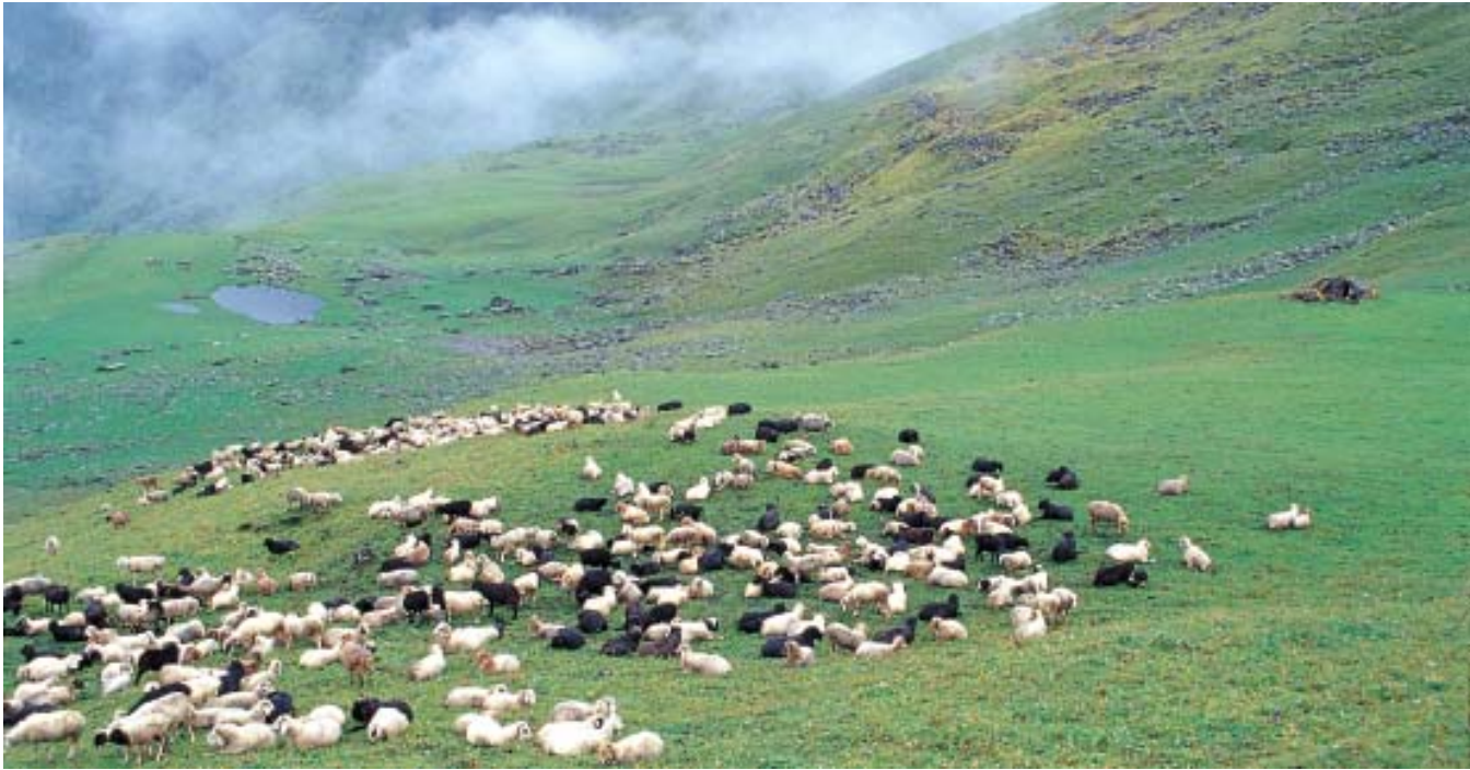
Fig. 1 – Sheep grazing on the Bugyals of eastern Garhwal.

Bugyals are vast natural pastures on the high mountains, above 12,000 feet. They are under snow in the winter and come to life after April. At this time the entire mountainside is covered with a variety of grasses, roots and herbs. By monsoon, these pastures are thick with vegetation and carpeted with wild flowers.