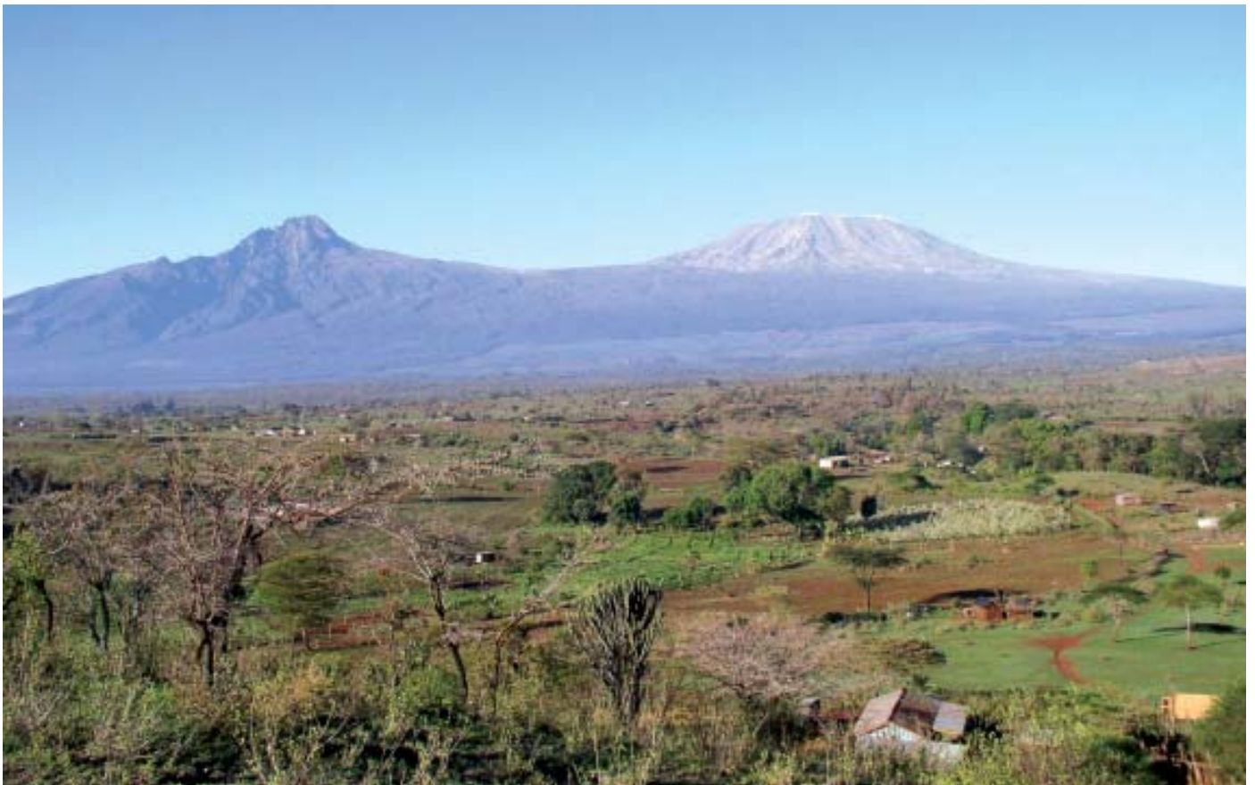
Fig. 12 – A view of Maasai land with Kilimanjaro in the background. Forced by changing conditions, the Maasai have grown dependent on food produced in other areas such as maize meal, rice, potatoes, cabbage. Traditionally the Maasai frowned upon this. Maasai believed that tilling the land for crop farming is a crime against nature. Once you cultivate the land, it is no longer suitable for grazing.

Like pastoralists in India, the lives of African pastoralists have changed dramatically over the colonial and post-colonial periods. What have these changes been?