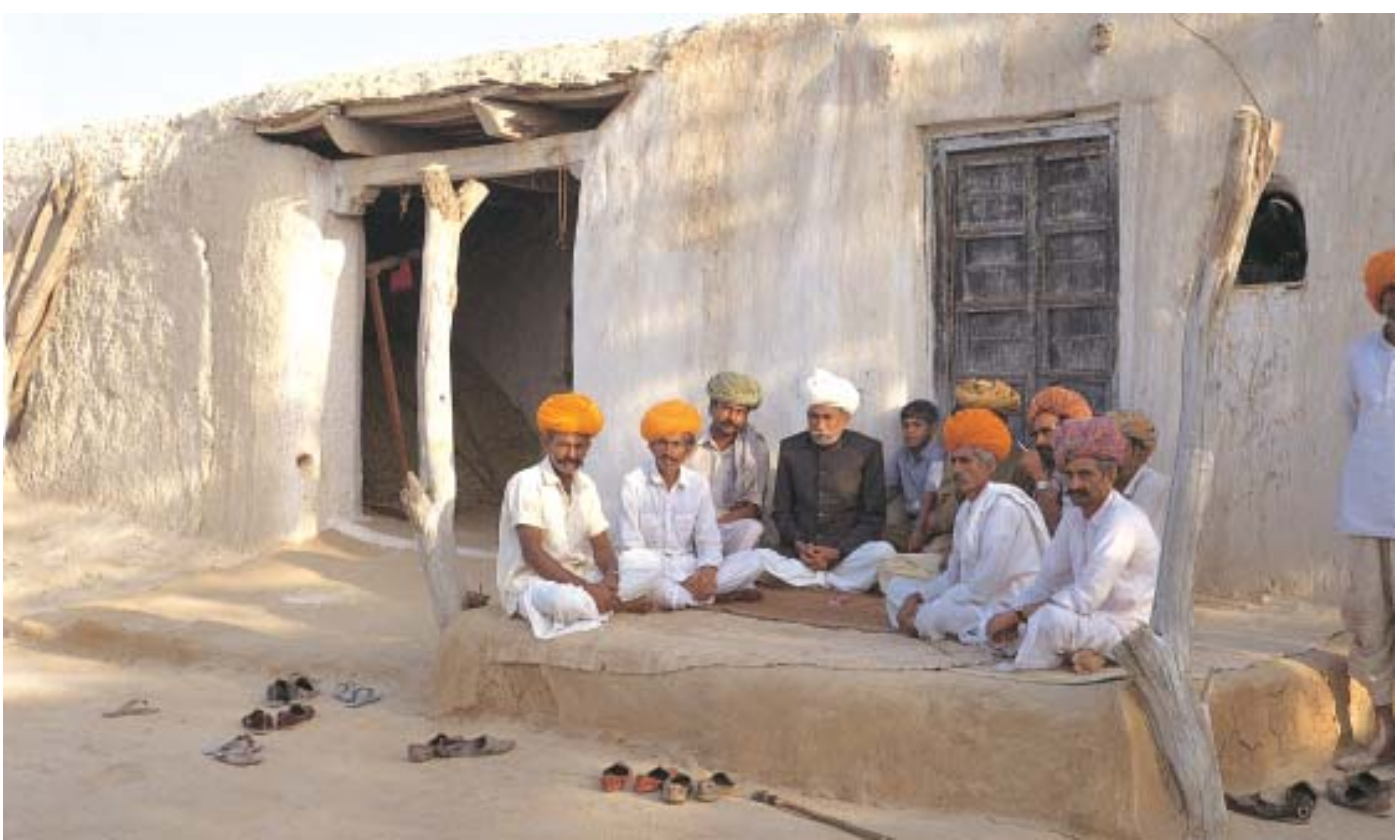
Fig.9 – A Maru Raika genealogist with a group of Raikas. The genealogist recounts the history of the community. Such oral traditions give pastoral groups their own sense of identity. These oral traditions can tell us about how a group looks at its own past.