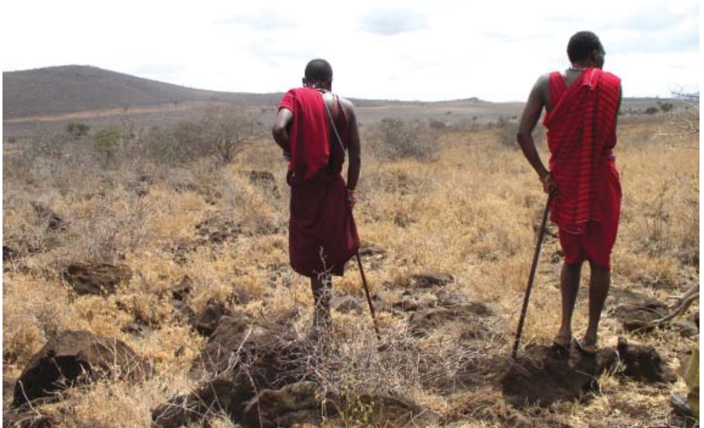
Fig. 14 – Without grass, livestock (cattle, goats and sheep) are malnourished, which means less food available for families and their children. The areas hardest hit by drought and food shortage are in the vicinity of Amboseli National Park, which last year generated approximately 240 million Kenyan Shillings (estimated $3.5 million US) from tourism. In addition, the Kilimanjaro Water Project cuts through the communities of this area but the villagers are barred from using the water for irrigation or for livestock.

Large areas of grazing land were also turned into game reserves like the Maasai Mara and Samburu National Park in Kenya and Serengeti Park in Tanzania. Pastoralists were not allowed to enter these reserves; they could neither hunt animals nor graze their herds in these areas. Very often these reserves were in areas that had traditionally been regular grazing grounds for Maasai herds. The Serengeti National Park, for instance, was created over 14,760 km. of Maasai grazing land.