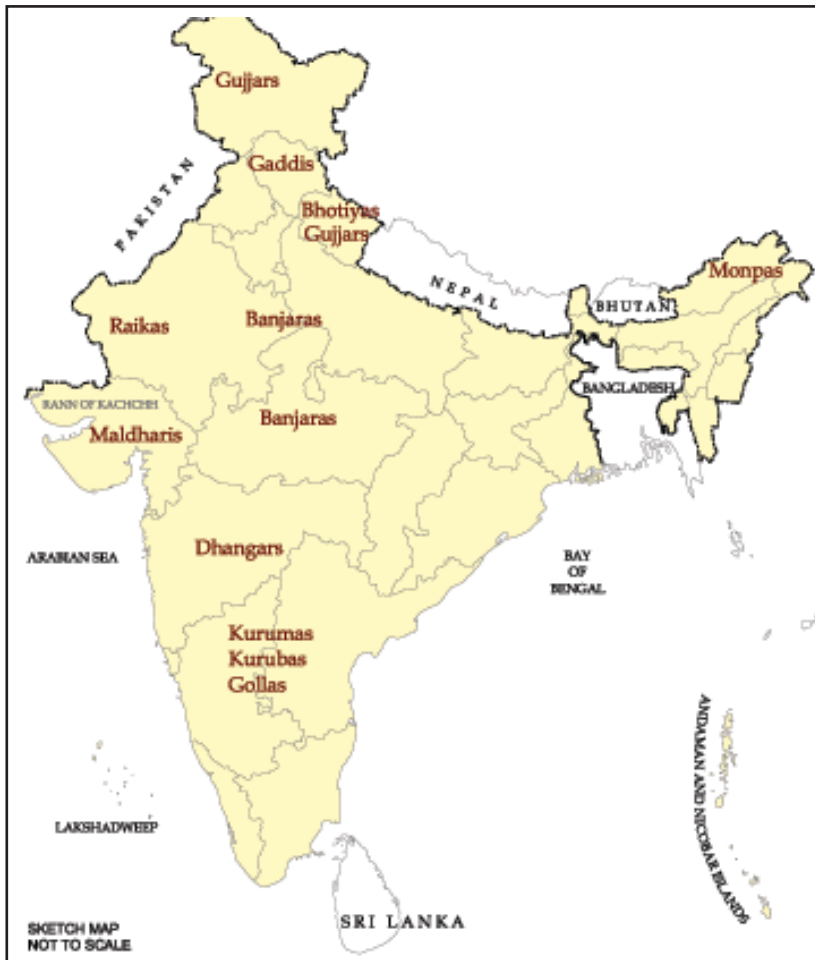
Fig. 11 – Pastoralists in India. This map indicates the location of only those pastoral communities mentioned in the chapter. There are many others living in various parts of India.

As pasturelands disappeared under the plough, the existing animal stock had to feed on whatever grazing land remained. This led to continuous intensive grazing of these pastures. Usually nomadic pastoralists grazed their animals in one area and moved to another area. These pastoral movements allowed time for the natural restoration of vegetation growth. When restrictions were imposed on pastoral movements, grazing lands came to be continuously used and the quality of pastures declined. This in turn created a further shortage of forage for animals and the deterioration of animal stock. Underfed cattle died in large numbers during scarcities and famines.