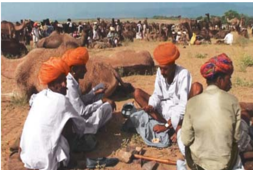
Fig.8 – A camel fair at Pushkar.

How did the life of pastoralists change under colonial rule?