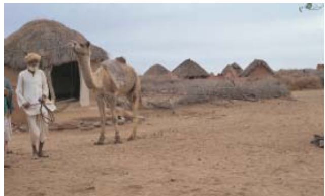
Fig. 6 – A camel herder in his settlement. This is on the Thar desert near Jaisalmer in Rajasthan. The camel herders of the region are Maru (desert) Raikas, and their settlement is called a dhandi.

In the deserts of Rajasthan lived the Raikas. The rainfall in the region was meagre and uncertain. On cultivated land, harvests fluctuated every year. Over vast stretches no crop could be grown. So the Raikas combined cultivation with pastoralism. During the monsoons, the Raikas of Barmer, Jaisalmer, Jodhpur and Bikaner stayed in their home villages, where pasture was available. By October, when these grazing grounds were dry and exhausted, they moved out in search of other pasture and water, and returned again during the next monsoon. One group of Raikas – known as the Maru (desert) Raikas – herded camels and another group reared sheep and goat.